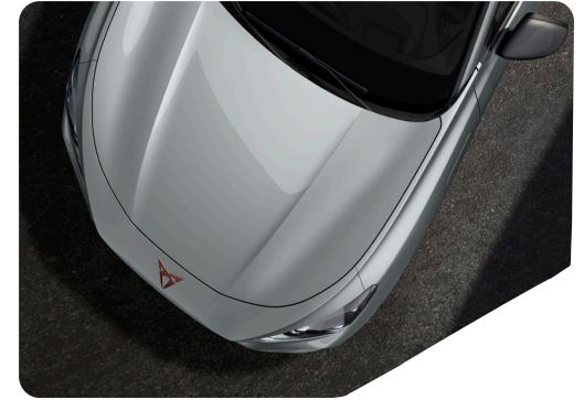
GLACIAL WHITE- 2Y2Y (Metallic) T VZ