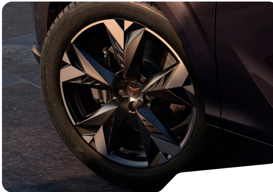
SPECTRUM 19" MACHINED SPORT BLACK MATT / SILVER T VZ