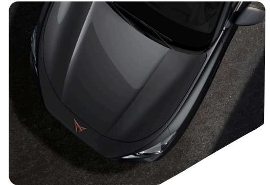
TIMANFAYA GREY - N7N7 (Metallic) T VZ