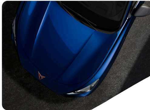
COSMOS BLUE - 2D2D (Metallic) T VZ