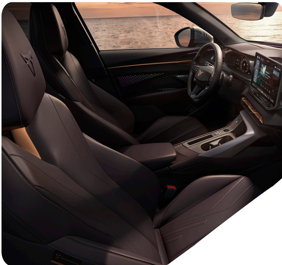
HIGH CANYON LEATHER SEATS - UD + PR2