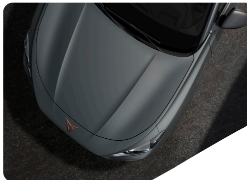
ENCELADUS GREY- Q7Q7 (Matt) VZ