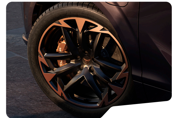
VORTEX 20" MACHINED SPORT BLACK MATT/ COPPER T VZ