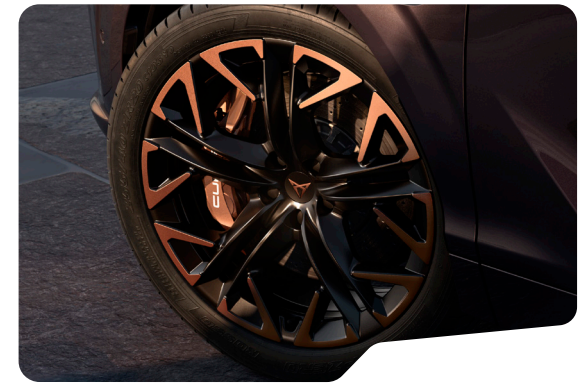
HADRON COPPER 20" MACHINED SPORT BLACK MATT/ COPPER T VZ