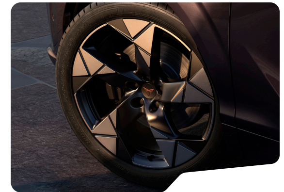
GRAVITY 20" MACHINED SPORT BLACK MATT/ SILVER T VZ