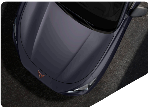
GRAPHENE GREY - R6R6 (Special) T VZ