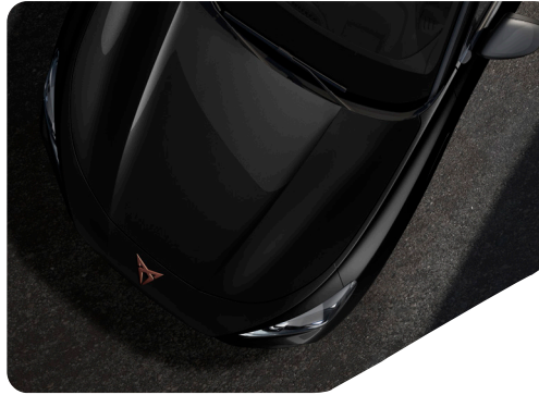
MIDNIGHT BLACK- OE0E (Metallic) T VZ