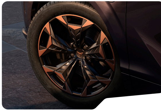
COSMIC COPPER 19" MACHINED SPORT BLACK MATT/COPPER T VZ