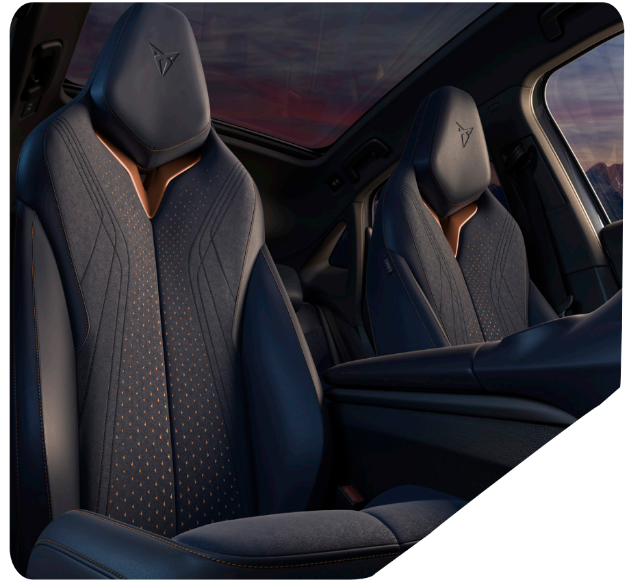
DARK NIGHT BUCKET SEATS - AI Endurance 6 VZ 9