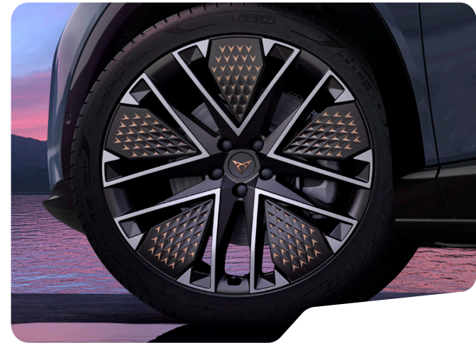
ETNA 21IN MACHINED WHEELS