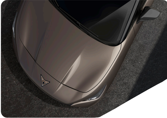
ATACAMA DESSERT - 1B1B (Soft) EN VZ