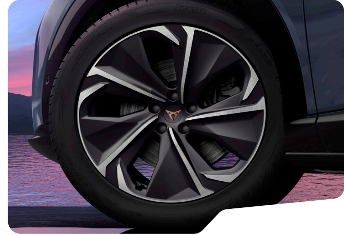
HECKLA 20IN MACHINED WHEELS