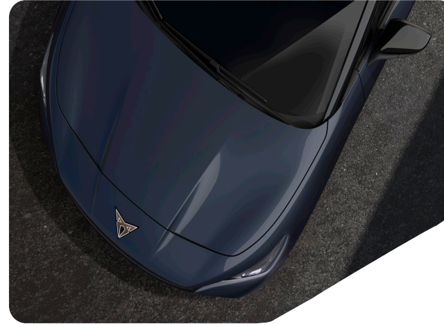
TAVASCAN BLUE- D9D9 (Special Metallic) EN VZ