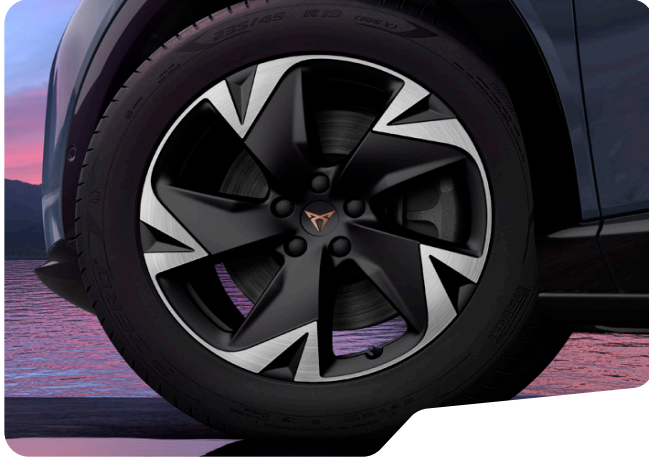
VULCANO 19IN MACHINED WHEELS