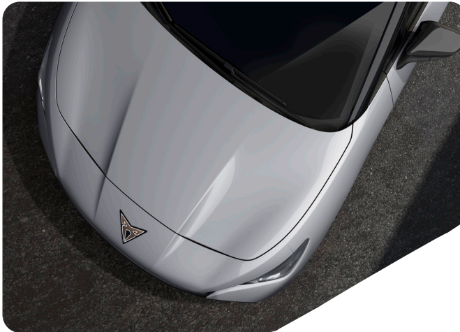
WHITE SILVER - K8K8 (Metallic) EN VZ