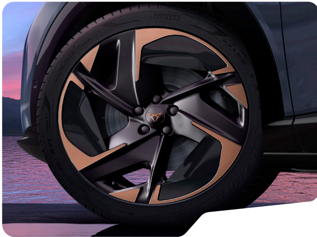
KATLA 21IN MACHINED WHEELS