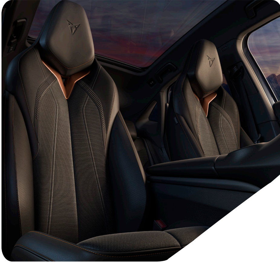
PURE BUCKET SEATS - AD Endurance 4 VZ 8