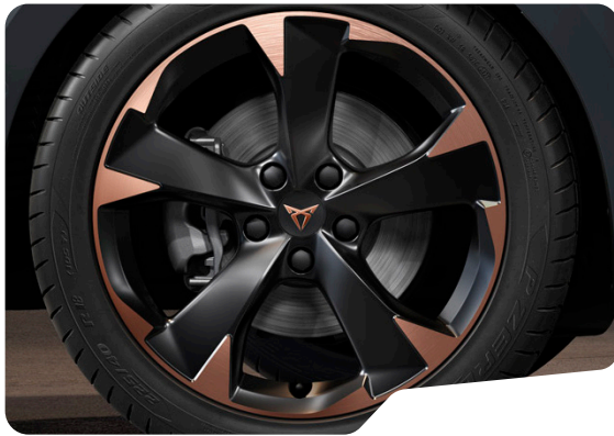
GARBI COPPER 18IN MACHINED COPPER L