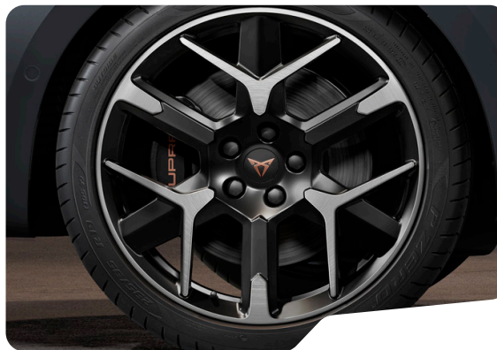
HAILSTORM 19IN FORGED MACHINED SPORT BLACK / SILVER VZ