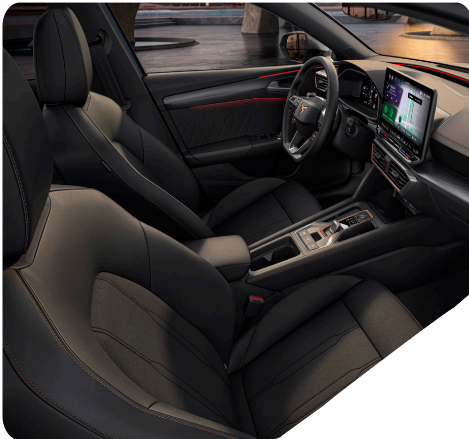
SHARP AMBIENT - AQ L