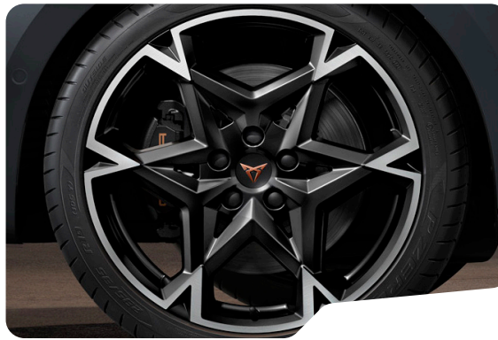
POLAR 19IN MACHINED SPORT BLACK / SILVER L VZ