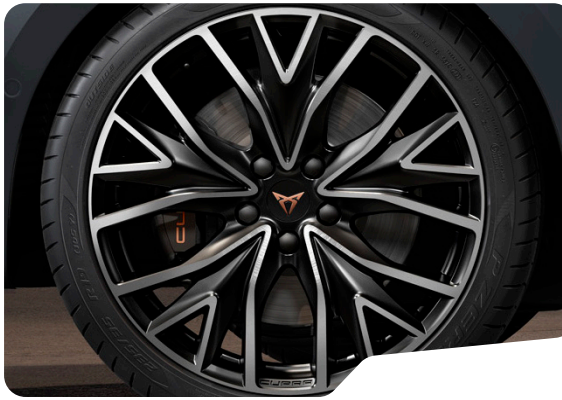
MISTRAL 19IN MACHINED SPORT BLACK / SILVER L VZ