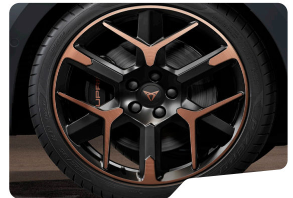
HAILSTORM COPPER 19IN FORGED MACHINED SPORT BLACK / COPPER VZ