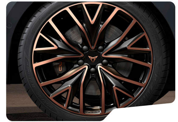
MISTRAL COPPER 19IN MACHINED SPORT BLACK / COPPER L VZ