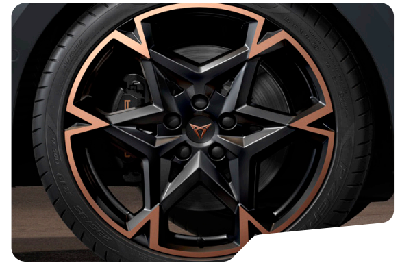
POLAR COPPER 19IN MACHINED SPORT BLACK / COPPER L VZ