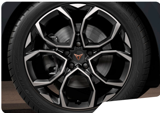
WINDSTORM 18IN MACHINED SPORT BLACK / SILVER L VZ